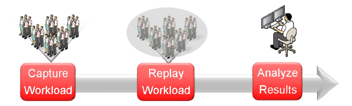
Real Application Testing capturing and replaying production workload onto test environment

Oracle Database 11g Release 2 also includes features that significantly reduce the cost and risk associated with making these changes. Oracle Real Application Testing enables the capture of production workloads from Oracle Database 10g and Oracle9 i Database for replay against the latest release of Oracle Database 11g.