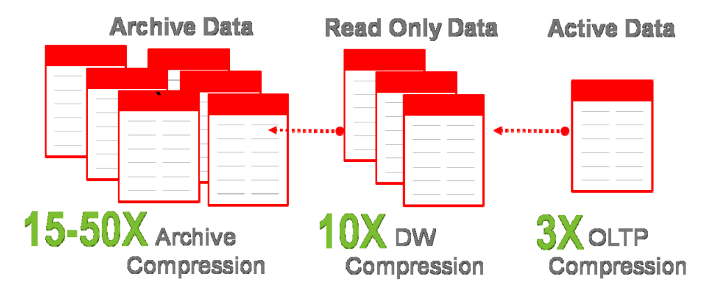
Example of partitioning and compression used to reduce storage costs

The Exadata Storage Servers in every Oracle Exadata Database Machine enable a new hybrid columnar compression technology that provides up to a 10 times compression ratio, without any loss of query performance. And for pure historical data, a new archival level of hybrid columnar compression can be used that provides up to 50 times compression ratios.